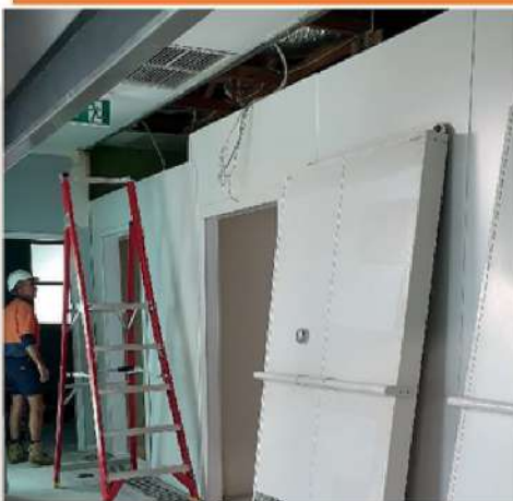
New fridge and freezer in the kitchen

The program of works is on schedule, for all services to be back on site for Christmas. We have a big community celebration planned to welcome everyone back to REDHS.