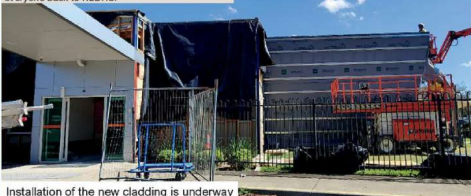
Installation of the new cladding is underway