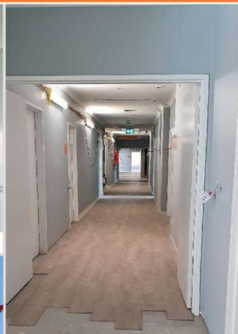
New flooring, paintwork and colour scheme