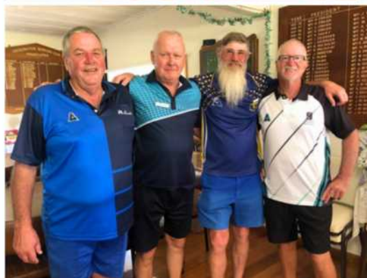
Top left: Lockington 4's Tournament winners - Moama.