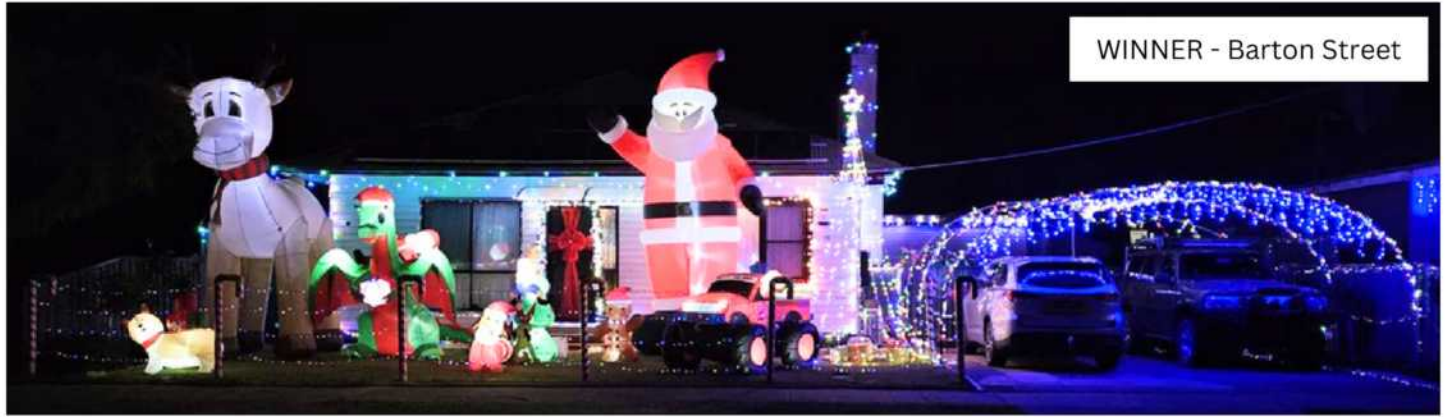
WINNER - Barton Street