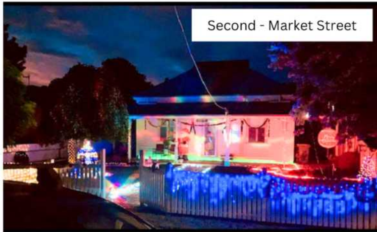
Second - Market Street