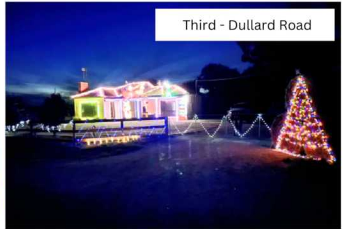
Third - Dullard Road