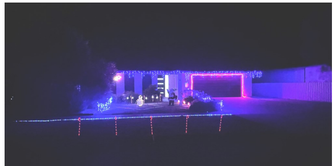
7. Lucas Crescent