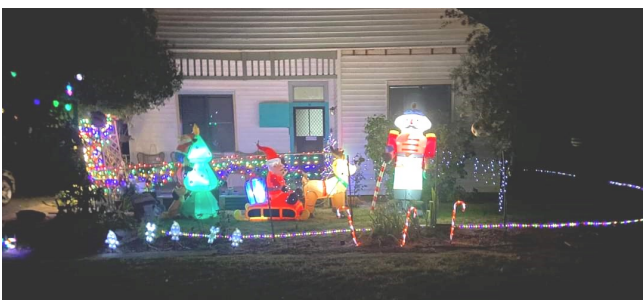
4. McColl Street