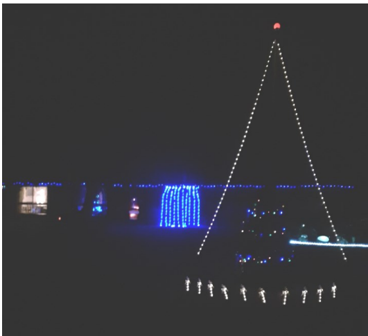
2. Pannoo Road