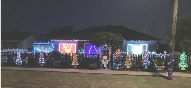
1. Archibald Street