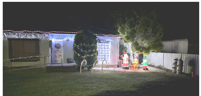
8. Lockington Road