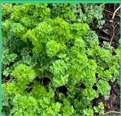
LOCKINGTON COMMUNITY EDIBLE GARDEN