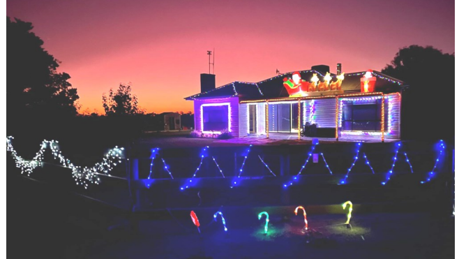
5. Dullard Road