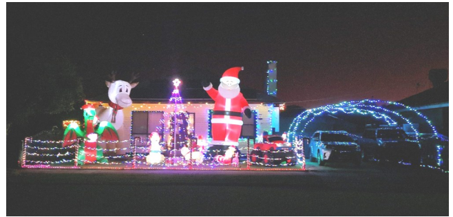
6. Barton Street