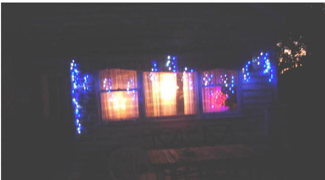
3. Singer Road