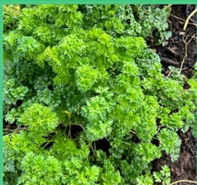
LOCKINGTON COMMUNITY EDIBLE GARDEN

Forms are available from Lockington Neighbourhood House