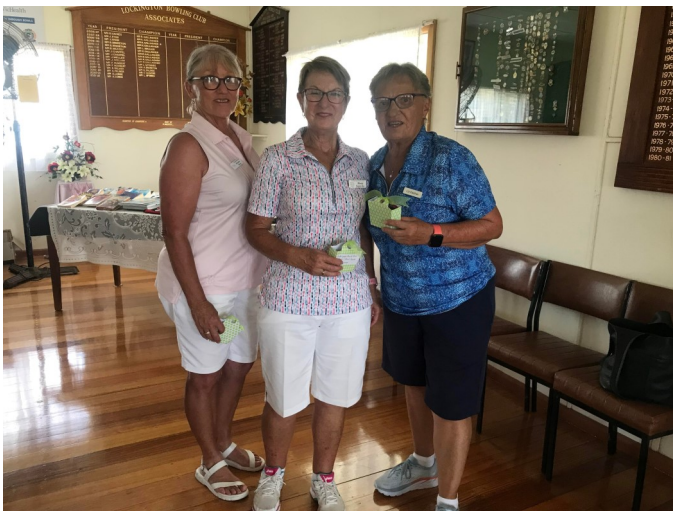
Winners Rich River - Ladies 3 Bowls Triples tournament.