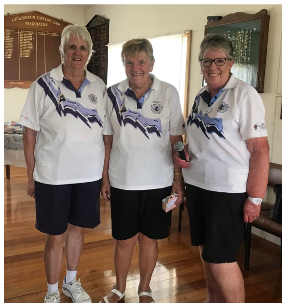
Runner up – Ladies 3 Bowls Triples Tournament