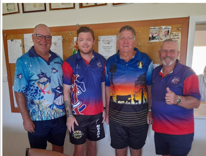
Runner Up Team: MCC Kangaroo Flat