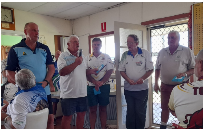
Winners: Rochester Tongala Team