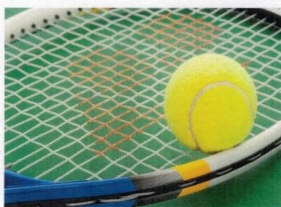
Taken in Lockington Courts. 2019