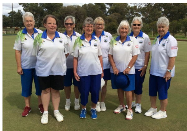
Above: Locky Ladies Club Pennant Final players

"Grevillias and Bottle Brush played off in the Final of the Club Pennant. It was a fantastic game with Grevillias finally edging out Bottle Brush on the last end"