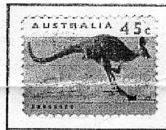
Correct Trimming with 3mm (1/8") border.