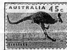
*Trimmed too closely with too much paper removed.

Winter... woolie jumpers, beanies, gloves, warm fires, hot chocolate, marshmallows toasted by the fire, a hearty stew, suggles on the couch, warm hugs from friends and family. What is Winter to you?