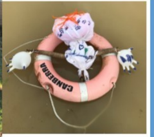
My Heart Will Go On