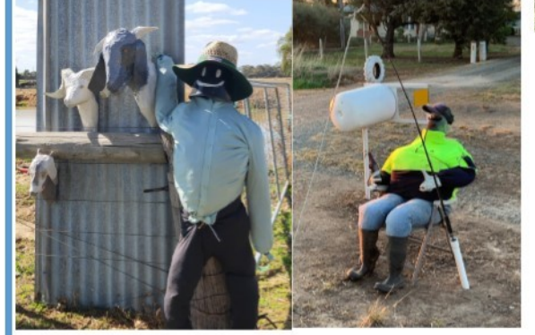
Tame the Goats