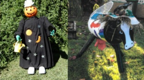
Crazy Cow Mrs Pumpkin Head