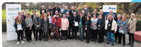
Gardiner Dairy Foundation — Investing for a Vibrant Dairy Future

For further grant information please go to: www.frrr.org.au/grants/gardiner-victorian-dairy