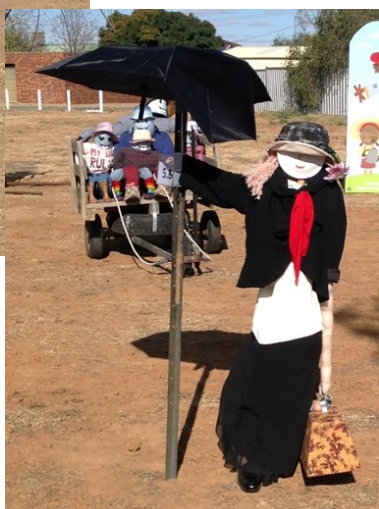
RIGHT... 3 rd : Lockington Kindergarten – “Kindy”