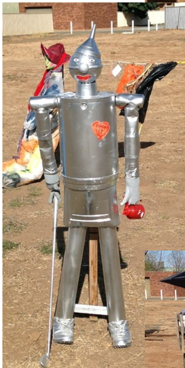
LEFT... Sporting Group/ School: Lockington Golf Club – “The Tinny Golfer”