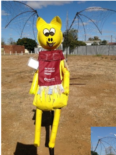
LEFT... Business Category: Lockington Community Bank – “Piggy”

The winners of this year's competition were: