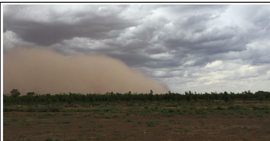
Storm rolling in over Kotta on the 6 th February