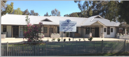
ISSUE 128 - February 2019